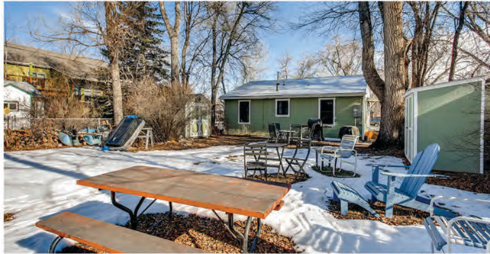
VIEW FROM BACK YARD