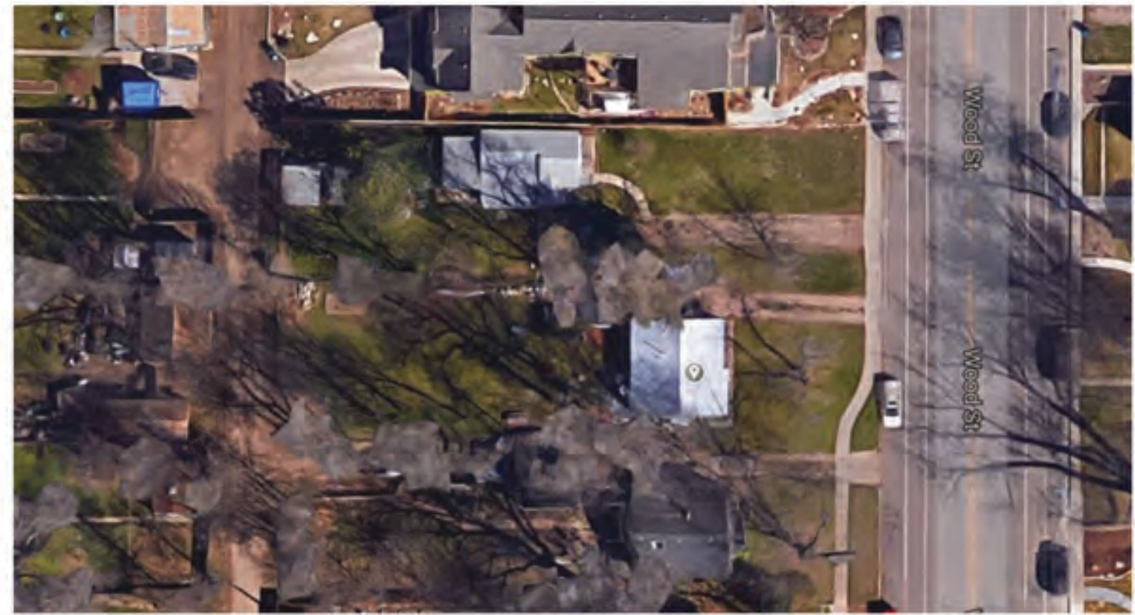
EXISTING SITE VIEW